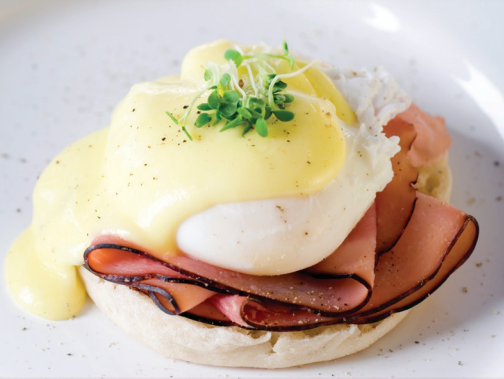
EGGS BENEDICT Made-To-Order Classic Eggs Benedict with Canadian Ham & Hollandaise and Chef's Creative Selection Dujour