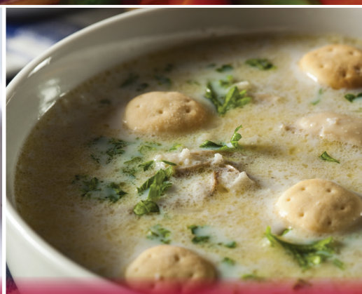
SOUP & SALAD STATION New England Style Clam Chowder, Caesar Salad, Mixed Greens Salad, Pasta Salad, and Fresh Fruit