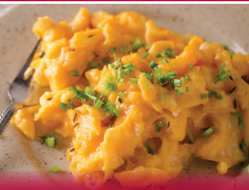
Pork Sausage Patties, Bacon, Chicken Sausage, Scrambled Eggs and Breakfast Potatoes